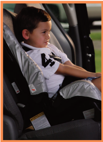
JESSE WHITE Secretary of State